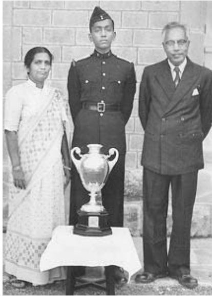
With my parents, when I passed out of the National Defence Academy (December 1957) as First among the Naval Cadets

doubted my salvation. I dropped an anchor that day on the ground of God's infallible Word and my ship has never drifted since then. I have been battered by many fierce storms in these years, and my ship has swung wildly at times, but my anchor has held . How can I explain that? I can only say that God gave me the grace to "believe" His Word that day . Even faith is a gift of God. So we cannot glory even in our faith. All we can do is humbly glorify God.