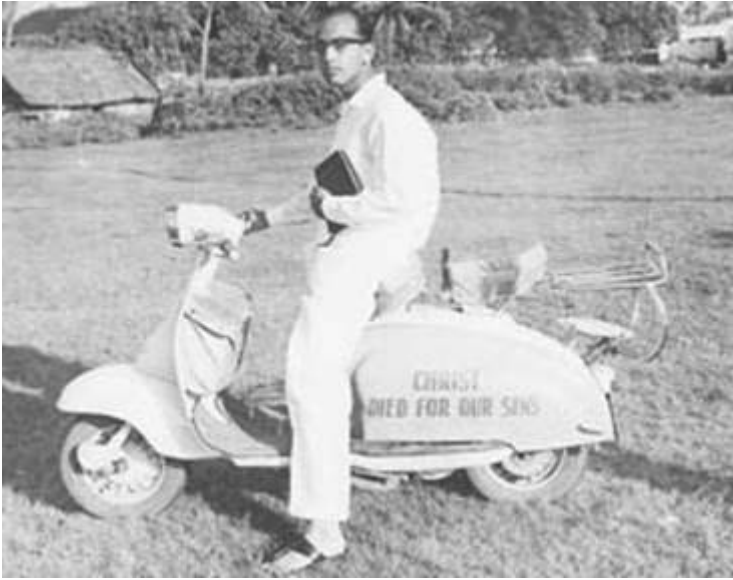
Bible Verses on the Scooter – July 1964