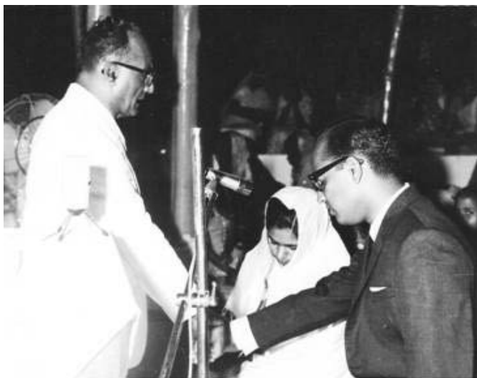
Wedding Conducted by Brother Bakht Singh at Vellore on 19 June 1968