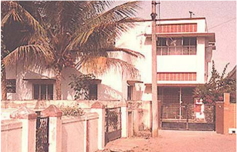
16 DaCosta Square , Bangalore, India – where we first started meeting as a church on 17 August 1975

When I gave away all my earnings for God’s work and left the Navy to serve the Lord, I never thought I would ever own a house in my entire life. But God had plans that I knew nothing about. He even removed a government in Kerala so as to enable me to buy this house in Bangalore. It is wonderful to see the perfect timing of God in everything He does. As we seek to honour Him, He honours us. Hallelujah!