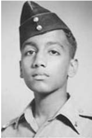
As a Cadet in the National Defence Academy September 1955

Be sensitive to the voice of the Holy Spirit. You will never know until you stand before the Lord how much you missed whenever you did NOT obey that voice.